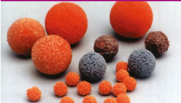
Elastomeric rubber balls