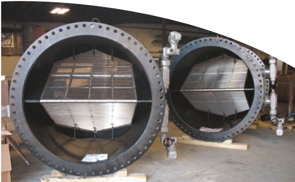
Dual screen ball strainers