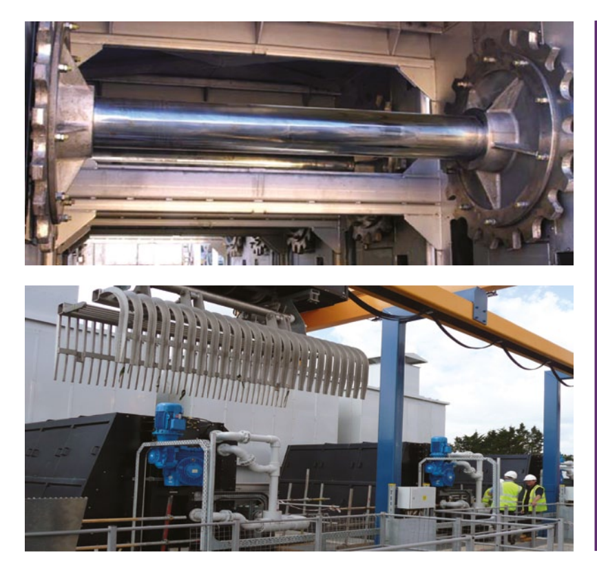
The robust design of the Brackett Green® Traveling Band Screen is highlighted by the robust headshaft construction of these screens awaiting dispatch.