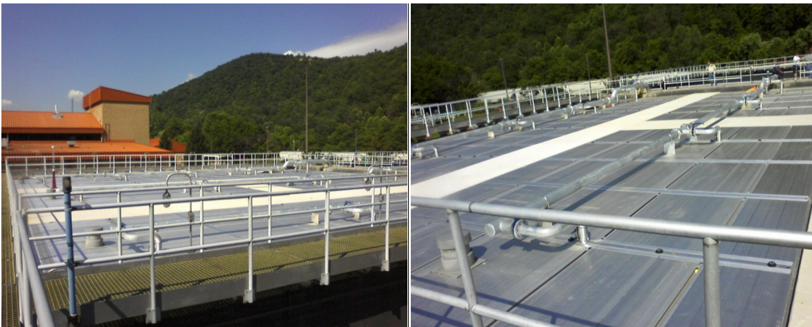
Figure 1. Bellefonte WWTP P.A.D. ® -M Facility

The Bellefonte WWTP P.A.D. ® -M Process design converted the existing equalization tank into three aerobic digestion tanks to be operated in series. Each aerobic digester tank was designed with an Airbeam ® Cover integrating Ovivo's MS ® diffusers and shear tubes to provide maximum mixing and aeration efficiency of thickened solids, minimize odors, and provide optimum temperature control during winter operations when Class B biosolids is most difficult to achieve.